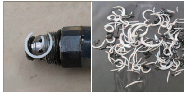
PTFE back-ups are pinched and broken during installation; leading to seal failure.